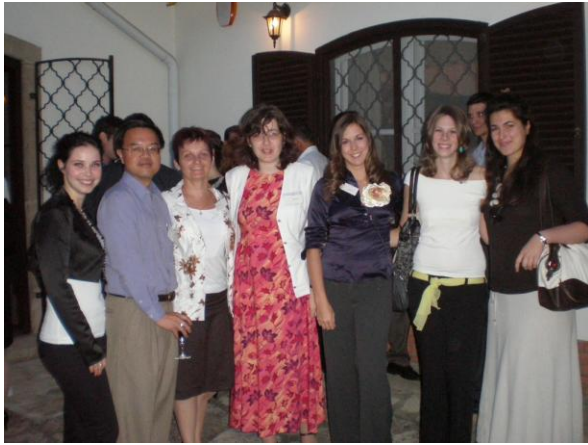
Hungary: Alumni Reception (above) and Orientation (r) in Leányfalu for orientation and a summer picnic. Each new Scholar received an ASSIST T-shirt.